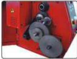
Metric and imperial thread cutting