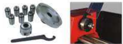
Mill chuck set