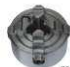
4-jaw chuck (independent)