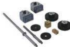
Digital readout for cutting depth kit (DRCD kit)