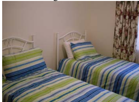
3 rd Bedroom