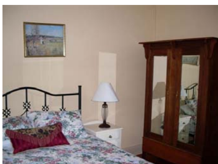
2 nd Bedroom