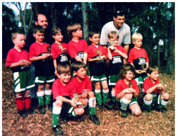
Arsenal—Funskills champions 2002