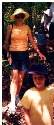
Bush-walking and leaf/stick-boat-making for a game of Pooh Sticks.

ney on the coast. Some friends kindly lent us their holiday house which they've just finished doing up, so it was very pleasant indeed.