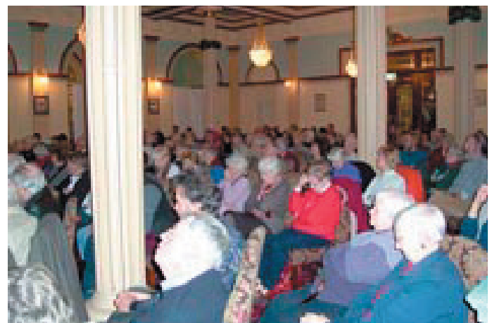
Part of the Speakers' Forum audience

Click on Local Branches & click on Blue Mountains webpage.